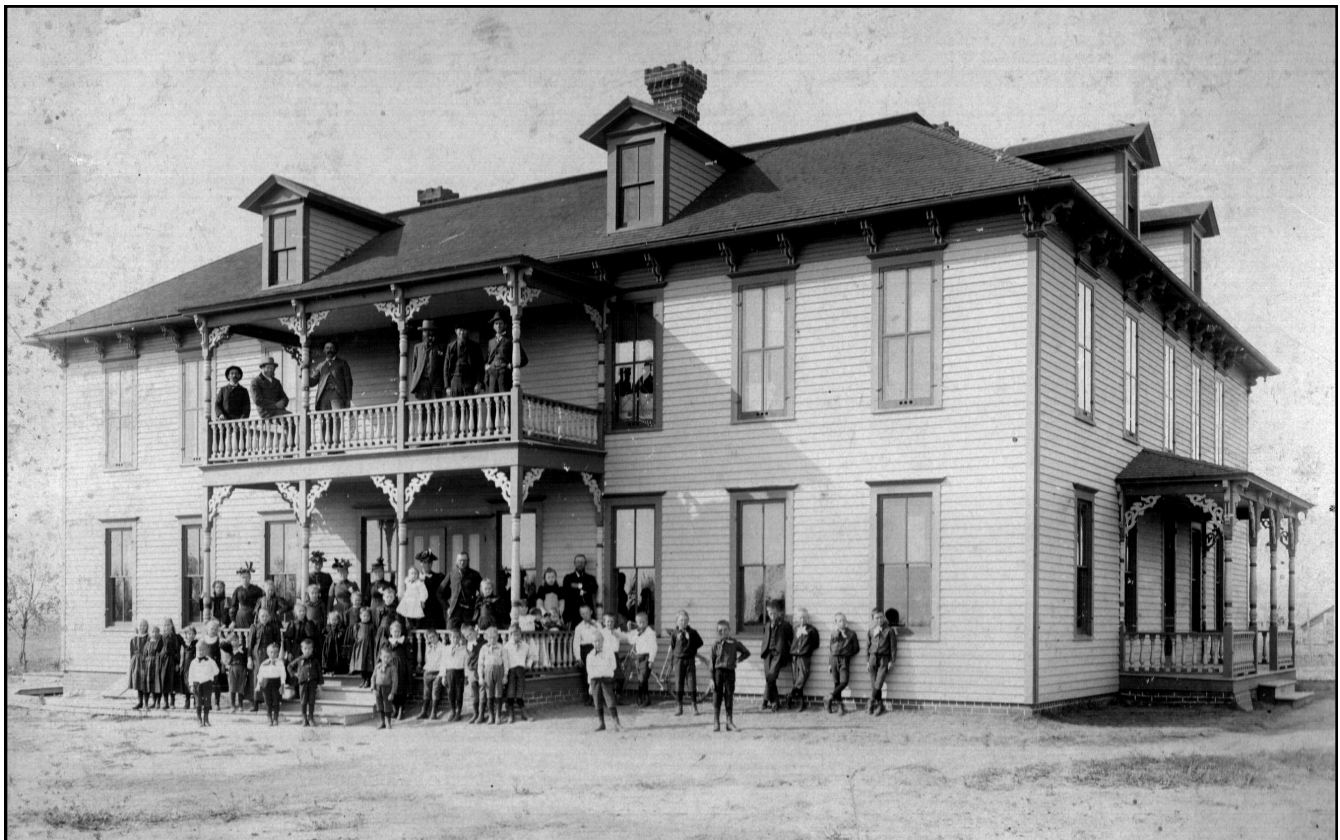
Christian Children's Home ~ October 14, 1895