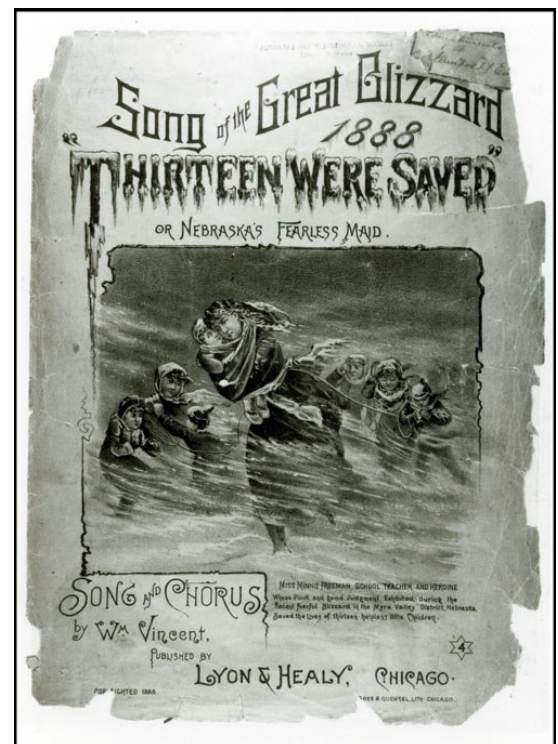
(Early Phelps Continued on page 5)

blind horse on the horsepower. While eating dinner about 1:00 o'clock, the storm struck. It came with a great roaring, a high wind and quite a flurry of snow, which did not last very long. I hurried over and did my work and by this time the mercury was falling at a rapid rate. It continued to fall throughout the night and into the morning, it was 30 below zero. There was very little snow, and I always say it was the coldest weather I ever experienced without snow on the ground. The day following the storm was clear and bright. One of the neighbor boys went to Holdrege and brought me a load of coal. Charley Peterson, now a resident of Funk, lived in Kearney County, several miles southeast of Minden. He relates how the cows drifted with the wind nearly three miles south and how he drove them against the wind, being out in