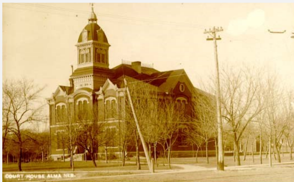
Original Harlan County Courthouse—Alma, Nebraska