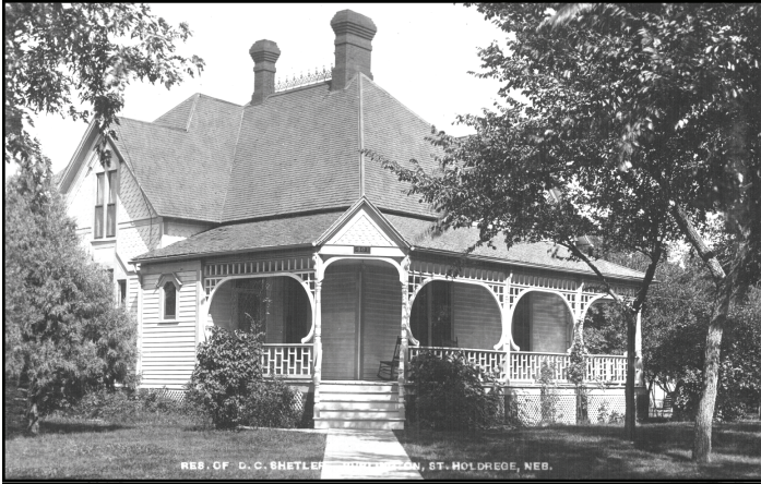
This is an early photo of the residence at 401 Burlington Street, later known as the Harris Funeral Home.