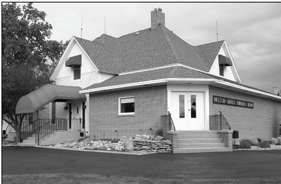
Current photo of the Nelson-Bauer Funeral Home located at 401 Burlington Street in Holdrege.