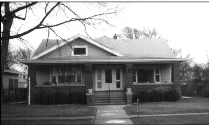
This is a photo of 718 East Avenue where the C.A. Baker Funeral Home was located.