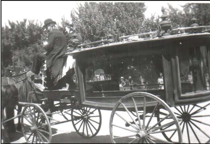
This is a photo of the C. A. Baker Funeral Home's hearse.