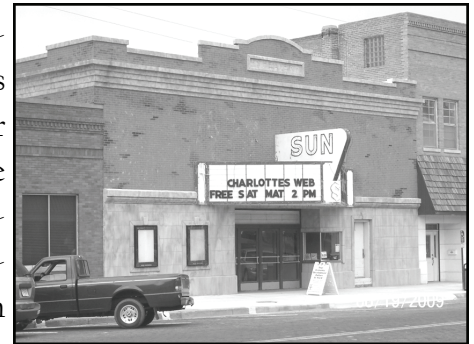
A June 19, 2009 photo shows the new exterior of the Sun. However, the sign has not been given its facelift yet.