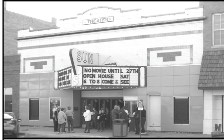
June 2009 Open House at the Sun Theater. The inside remodel was complete, and the outside facelift had not yet started.

A 1957 news article tells of a record smashing 928 kids attending a free movie at the Sun Theater courtesy of the Holdrege Chamber of Commerce. Babysitting services were provided for "busy mothers getting shopping done." The next movie advertised to be shown was "The Devil's Hairpin" and was described with "the roar and color of the world's fastest sport, sports car racing, its heart-