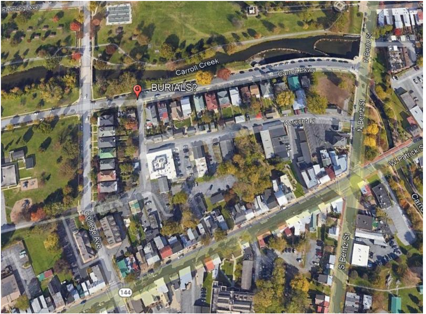
First Poor House Burial Ground