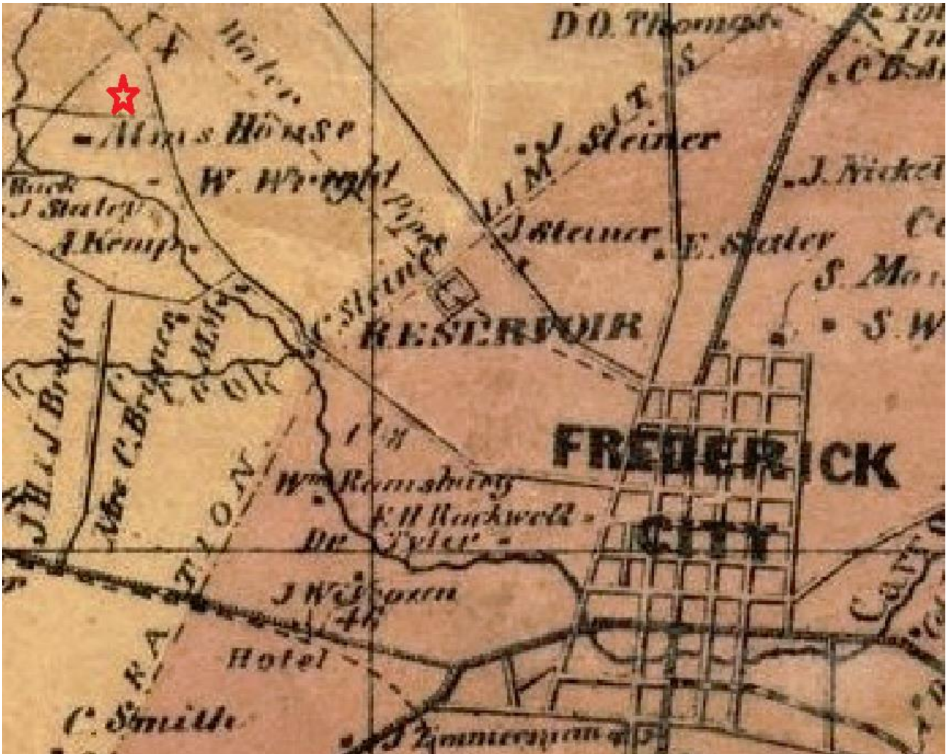
Alms House/Montevue Hospital