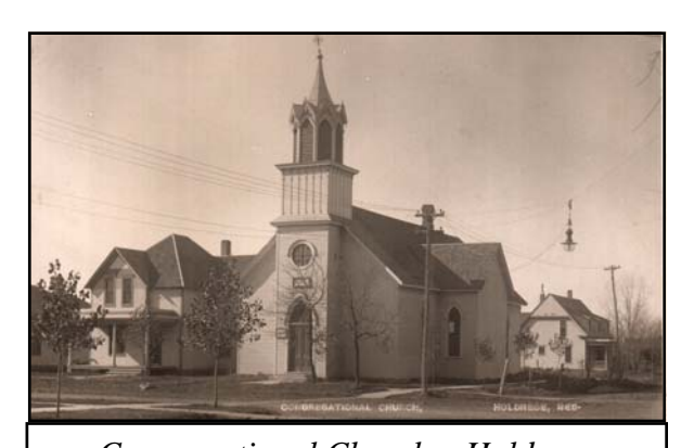
Congregational Church ~ Holdrege