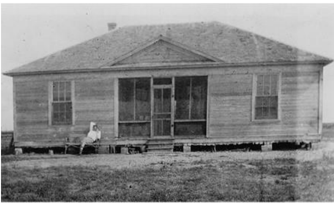
Cardiff Ranch House