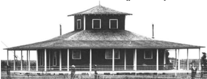
Van Ness Home on South Street