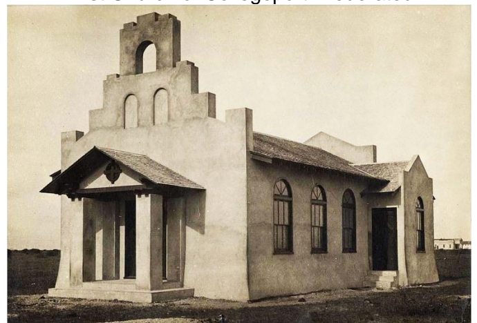
Grace Chapel of St. Mary's Mission.