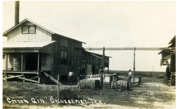
Collegeport Cotton Gin