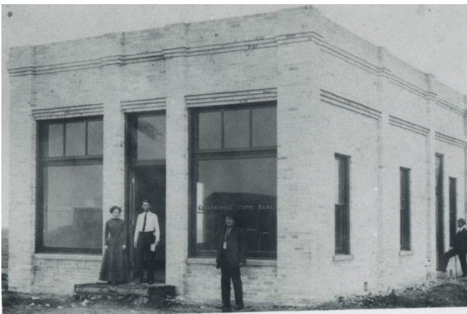
Collegeport State Bank