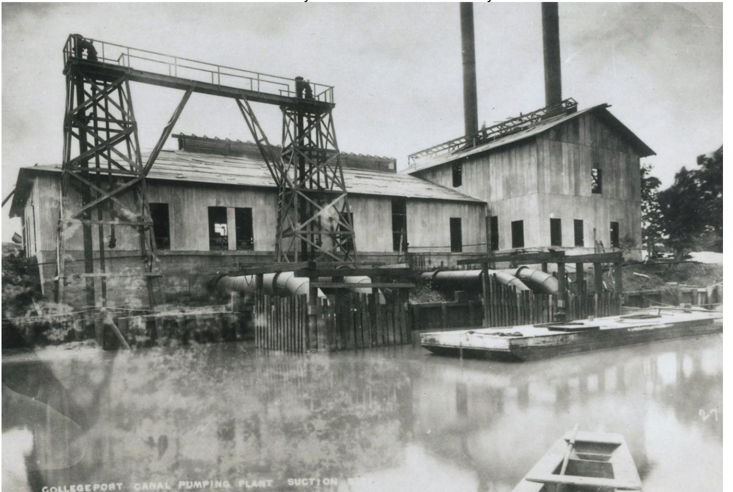
Collegeport Canal Pumping Plant