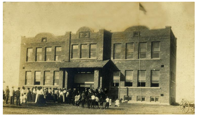
Bay View School