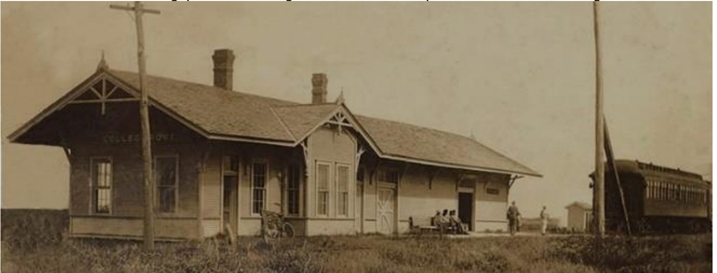
St. Louis, Brownsville & Mexico Railway Depot served the community until 1933 when service was terminated.