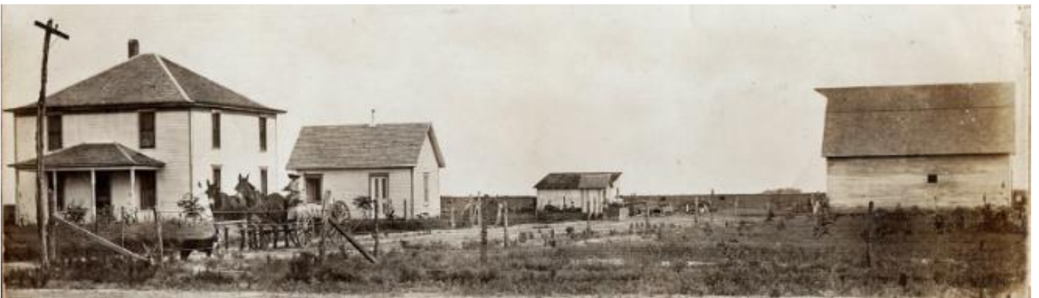
Columbus B. & Matilda Rose Farm near Citrus Grove

A number of these photos were recently shared from private collections. If you have documents or photos of Collegeport area farms, businesses or families we would be happy to include them in our archives.