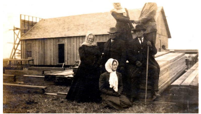
John T. Price Lumber Co.