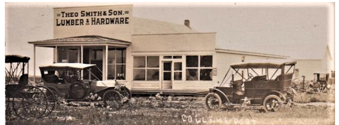
Theo Smith & Son Lumber & Hardware