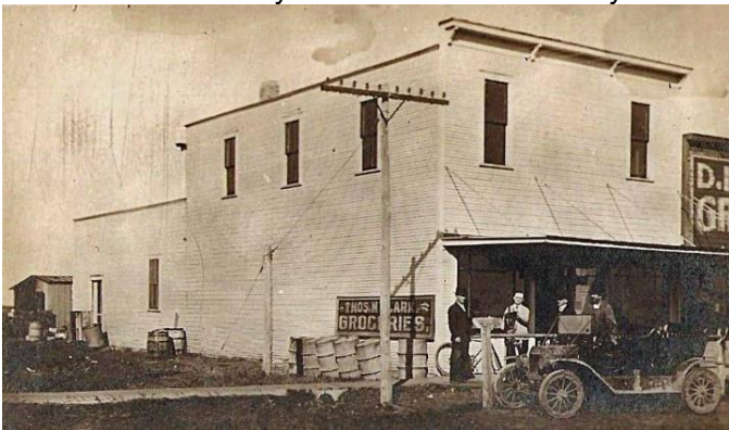
Thos. M. Clark Groceries