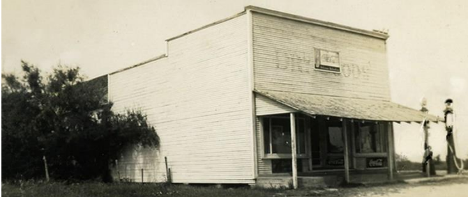
Kundingers Drug Store was formerly the Hoffman Pharmacy