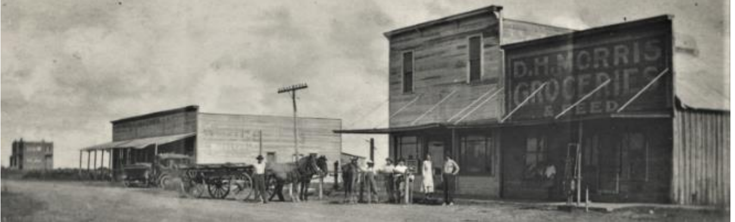
Businesses on Central Street (now Highway 1095) looking west. Bay View School to far left.