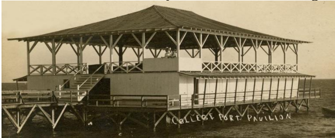
"Pagoda" Pavilion--Pilings can be seen in the bay.