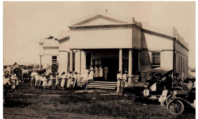
First Church of Collegeport--Federated