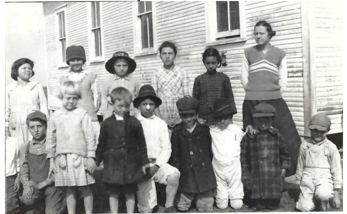
Children at the DeMoss School