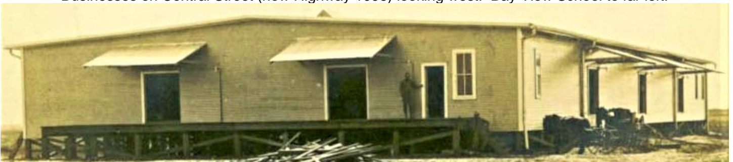
Matagorda Bay Warehouse and Commission Company