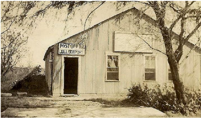
Collegeport Post Office; formerly the Cannery