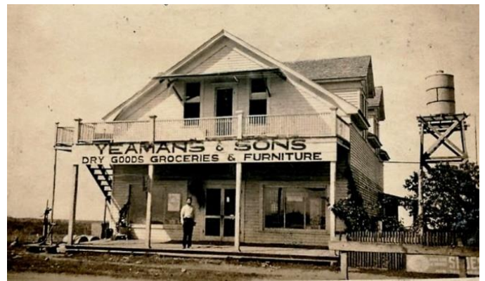
Yeaman & Sons Dry Goods, Groceries & Furniture at Citrus Grove