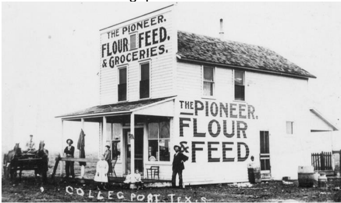
THE PIONEER. FLOUR, FEED, & GROCERIES